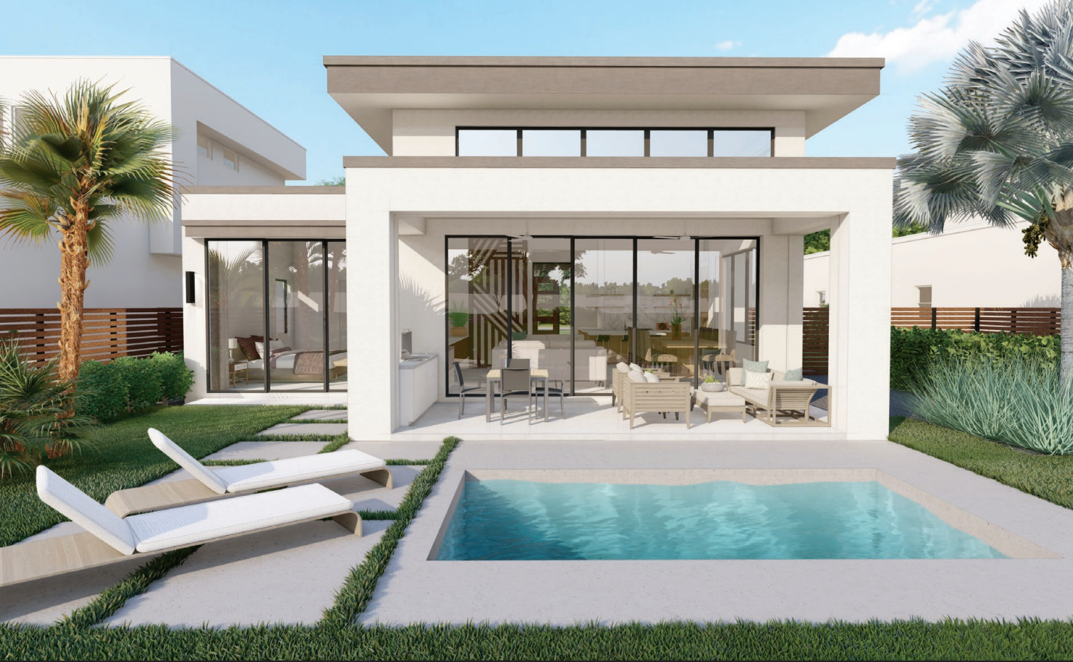
REAR ELEVATION *Shown with options