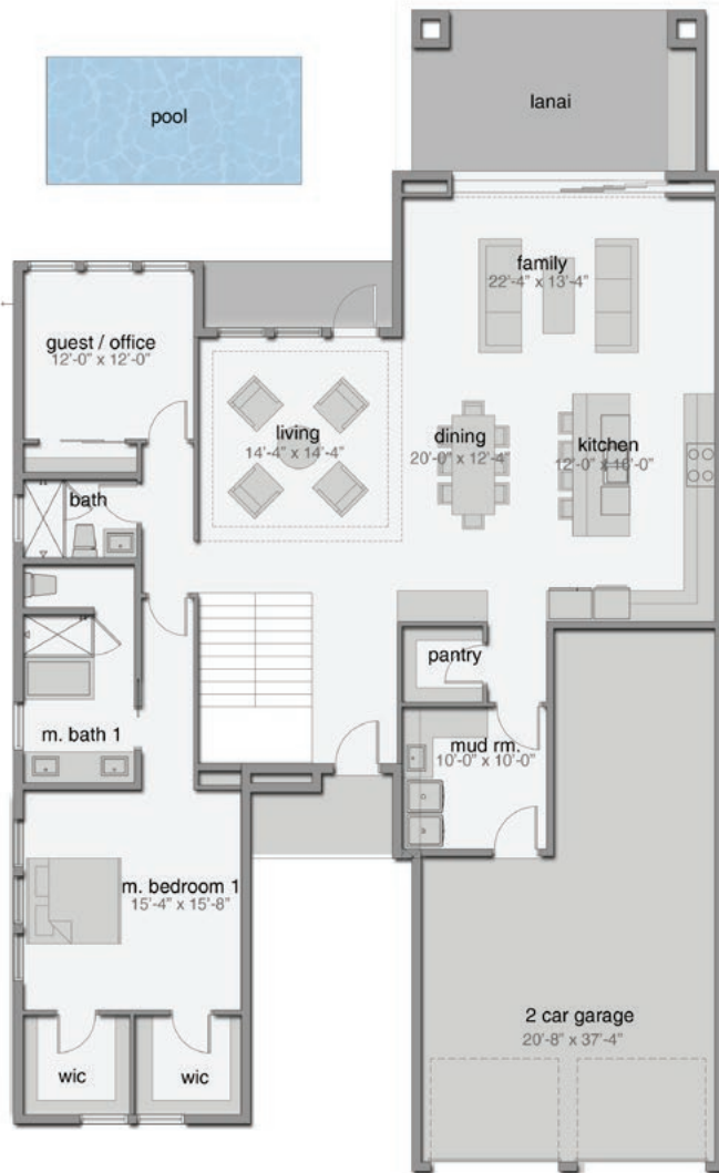
MAIN LEVEL PLAN