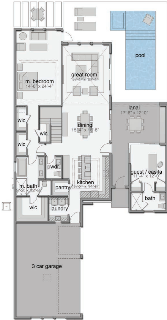
MAIN LEVEL PLAN