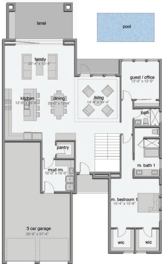
MAIN LEVEL PLAN